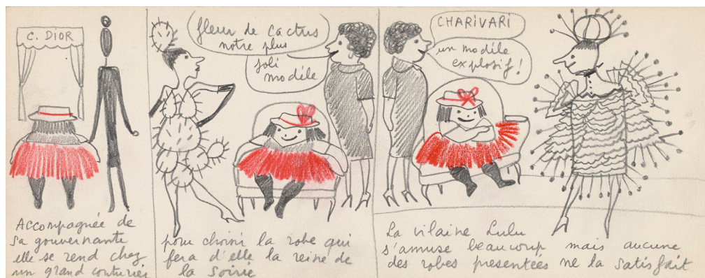
Yves Saint Laurent, original sketch for La Vilaine Lulu , "a difficult choice", 1956, sketch, graphite pencil and colored pencil on paper, 12,5 x 32,5 cm, musée Yves Saint Laurent Paris

* Yves Saint Laurent, La Vilaine Lulu , Paris, Éditions Tchou, second edition 2003.